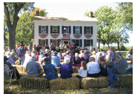
Old Settlers Day, 2007

Mark your calendars for Sunday, October 19, 1 until 4 pm for the second annual Old Settlers Day revival. Come enjoy the ambiance of the 1840s with period music, crafts, and food at the historic Strawbridge-Shepherd House located on Shepherd Road between UIS and LLCC. Admission is free.