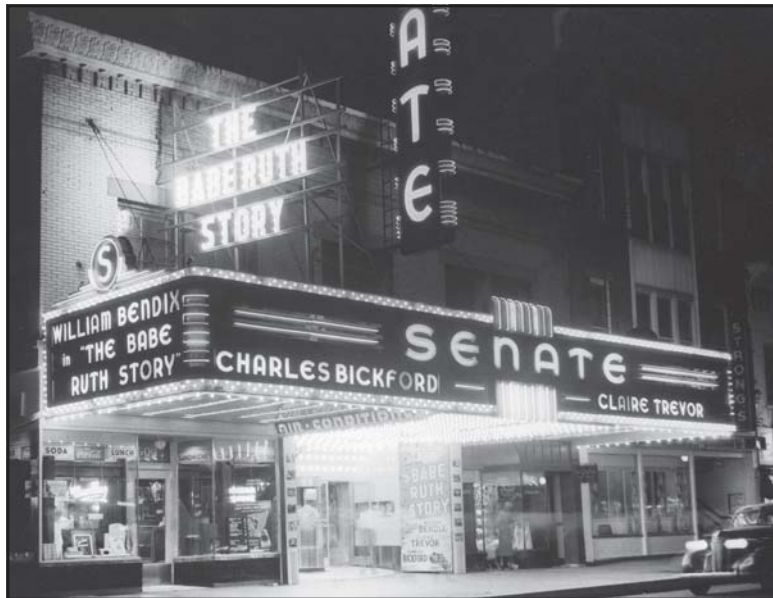
The Senate at 509 E. Monroe from 1929-1983.

Probably the most recognized theater was the Orpheum, built in 1927 at 122 North Fifth Street. The Orpheum was a lavishly decorated