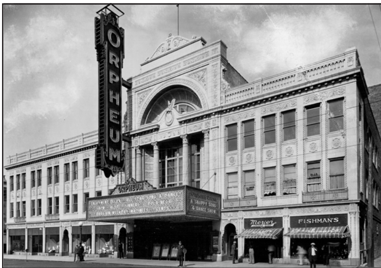
The Orpheum, located at 122 North Fifth Street, from 1927-1965.