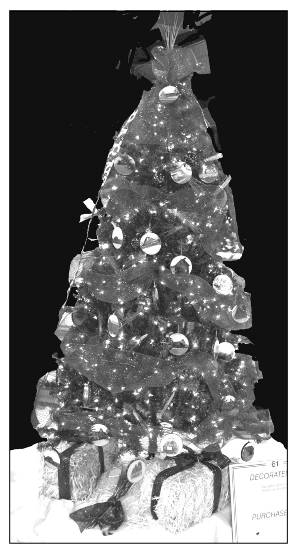
SANGAMON COUNTY BARNS provided the theme for one of the Society's past Festival of Trees entries. The tree was surrounded by ribbon-tied bales of hay.

The Society wreath reflects the ties it provides to members and the "Our tree always gets a lot of community throughout the year