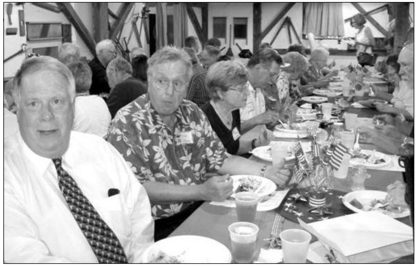
FULL HOUSE: Members turned out in full force for the June 21 Annual Dinner at Clayville. Tables were decorated in red, white and blue.