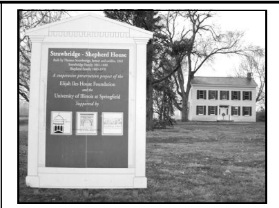
50TH CELEBRATION WRAPUP: Strawbridge House, decorated for the holidays, helped the Society wrap up its 50th year in a special setting. See photos (by Donna Catlin) on pages 4 sand 5