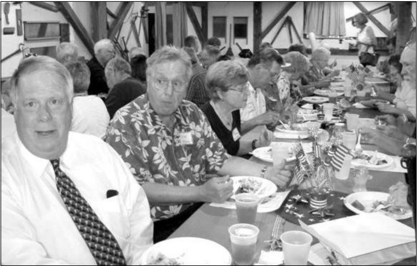
FULL HOUSE: Members turned out in full force for the June 21 Annual Dinner at Clayville. Tables were decorated in red, white and blue.