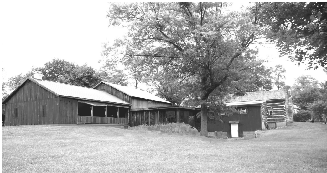
THE RUSTIC CLAYVILLE HISTORIC SITE in Pleasant Plains with its charming outdoor pavilion and indoor dining will once again be the site of the Society's annual dinner, set for Tuesday, June 21. Elections are part of the event, but you must be a member in good standing (2022-2023 dues paid by May 31) to cast a vote.

If you want to mail in your renewal, you can use the form on the back page of this issue of Historico , (even though it says 2021-2022, we will automatically apply your payment to 2022-2023) or you can renew on line by going to the Society's website page, sangamonhistory.org and go to the Membership section. It will guide you through the on-line payment process.