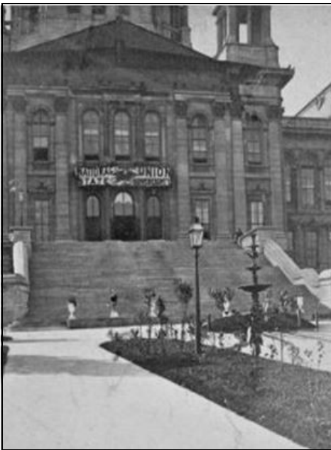
HALF of a stereoscopic view of the grand staircase (undated).

2021 told the story of the halting, 20-year effort to build Illinois' current Statehouse, and how modern technology – namely, the invention of steam-powered passenger elevators – allowed officials to eliminate the giant “grand staircase” that formed the original Capitol Avenue entrance to the building.