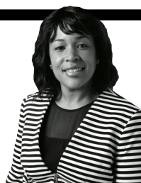
At the helm at Oak Ridge...5