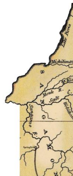
1821 Sangamon County