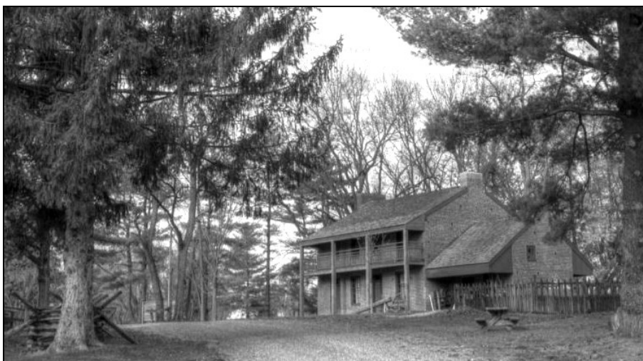
ON THE NATIONAL REGISTER: Broadwell Tavern at Clayville.

Clayville Historic Site in Pleasant Plains. A buffet dinner provided by Poe Catering, will follow at 6 p.m. in the air-conditioned dining area.