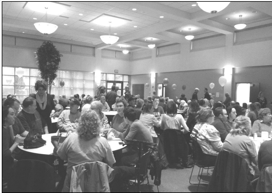
IN THE GAME: Last year's Trivia Night drew a room full of players. You could be among them this year!