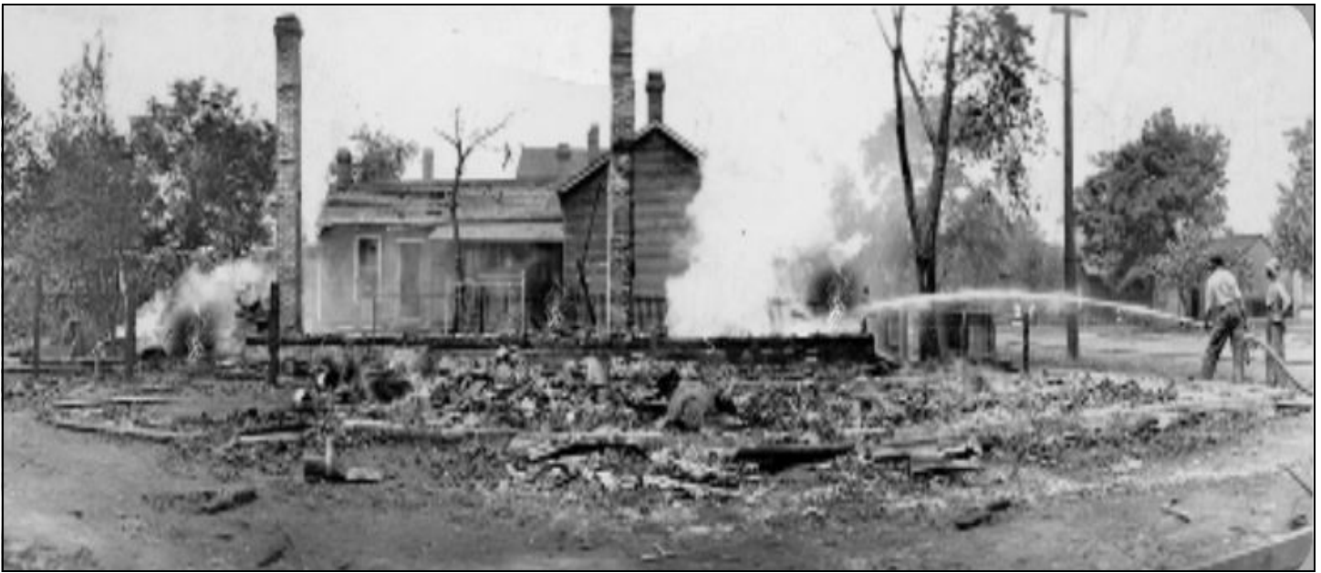
IN THE AFTERMATH: The 1908 Springfield Race Riot left death and destruction in its path. A violent mob left homes of black residents and businesses in ruin. This photo, part of the February 21 Powerpoint timeline presentation, is in the collection of the Abraham Lincoln Presidential Library and Museum.