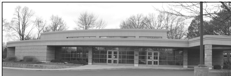
GAME SITE: Christ the King Parish Hall in Springfield, site of the March 18 Trivia Night.

The table with the last balloon standing wins the game, the glory, and half the money collected to play it. If there is a tie after the balloon round question in the 10th round, the tied tables will split the prize.