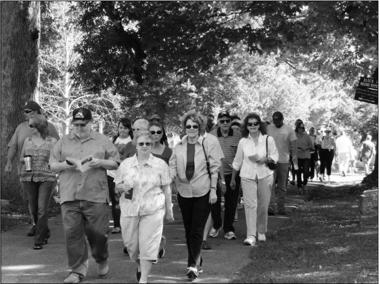
ON THEIR WAY: Participants in last year's cemetery walk head for one of the stops along the route.