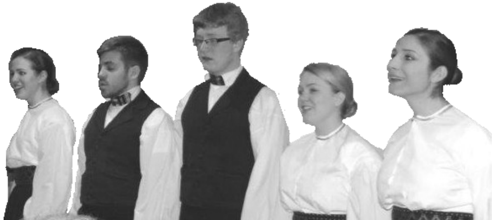
BREAKING INTO SONG: Some of the troubadours entertaining at last year's Trivia Night.

The team with the highest number of answers at the end of the game will share a cash prize, as will second and third place winners. In many cases, winning tables donate all or part of their prize back to the beneficiaries of the fundraiser, which was the case last year.