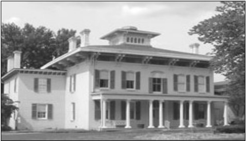
REOPENING: Edwards Place, which reopens to the public next month after being closed for nearly a year for renovations.

$490,000. The bulk of the funds were raised through private donations which were matched by a $150,000 challenge grant from the Jeffris Family Foundation of Wisconsin.